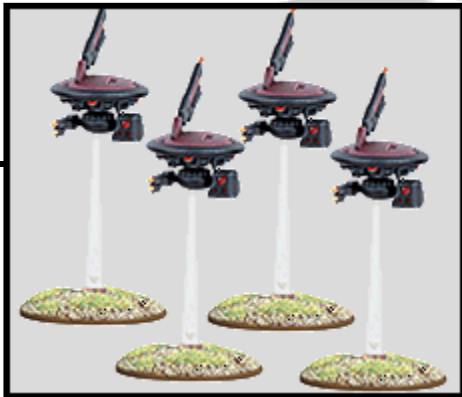
0-2 Markerlight Squadrons

Drones have been developed. These include the Shield Drone, the Marker Drone, the Remora Drone Fighter as well as the still experimental Command-link Drone. Though normally used in support of Tau combat units, some outposts and Septs have gone as far as building full Drone Regiments. Guided by advanced artificial intelligence they can be thrown into battle without concern for Tau life and are as such often used to delay enemy troops while citizens are evacuated from combat zones. In addition the Fio'vesa formation has seen frequent use at times when the Fire caste faced the Imperial Guard, the Drones proving priceless in dealing with the standard Imperial attrition method of war.