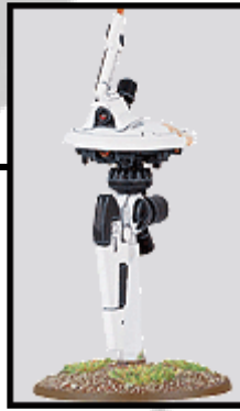
1 Command-link Drone