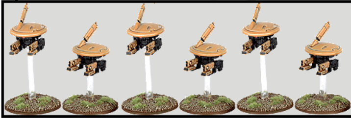
2+ Gun Drone Squadrons